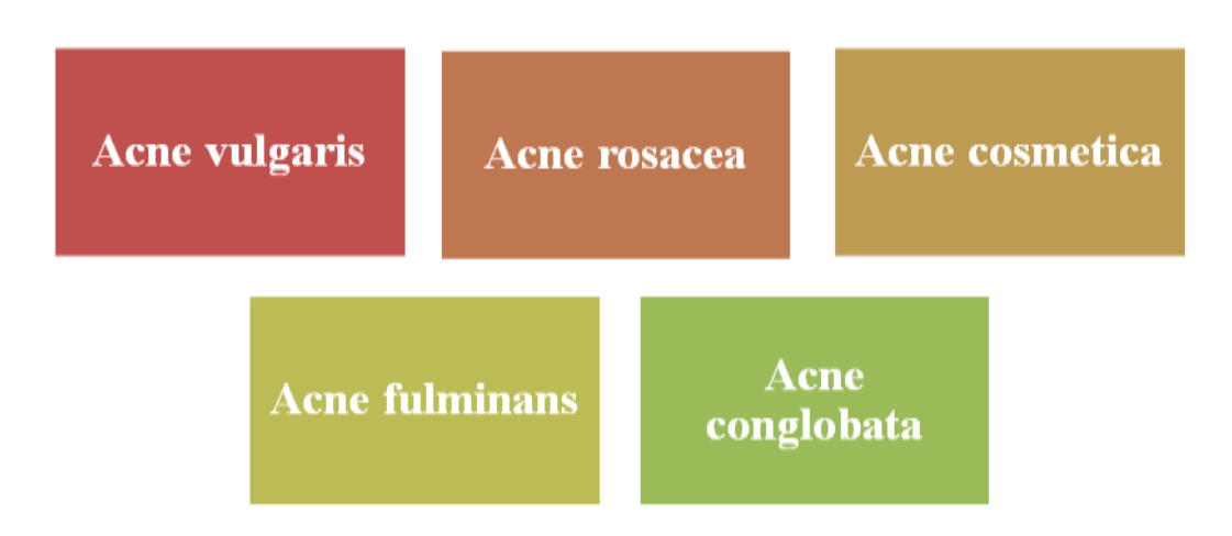
Figure 1:-Some types of Acne